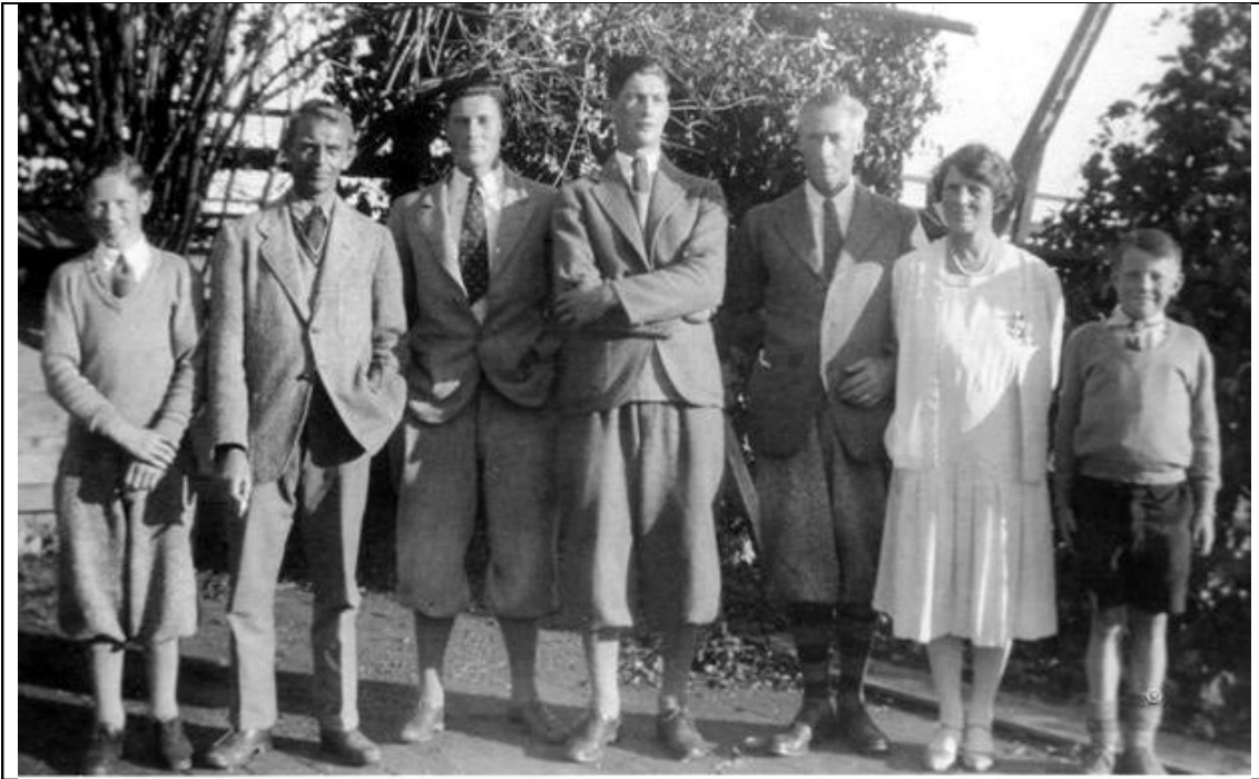
The Osler family in the late 1920s.